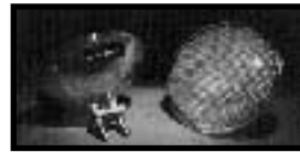
The SOLARBEAM bulbs can be handled without gloves and they simply plug in and out, as easy to replace as a household bulb.

SolarBeam is guaranteed to do the job one way - better! If it doesn't, Richmond will give you your money back! It's that simple.