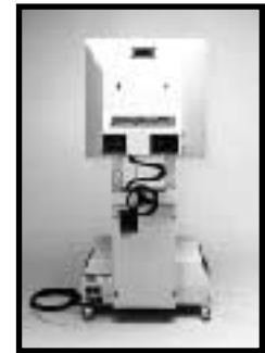
The FS models are height adjustable from 36" to 54" (center of bulb from floor level). A free wheeling handle moves a smooth screw drive up and down for precise center positioning.