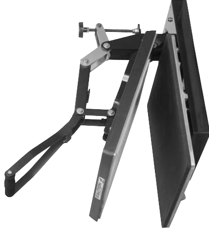
(Presto 20 Shown)