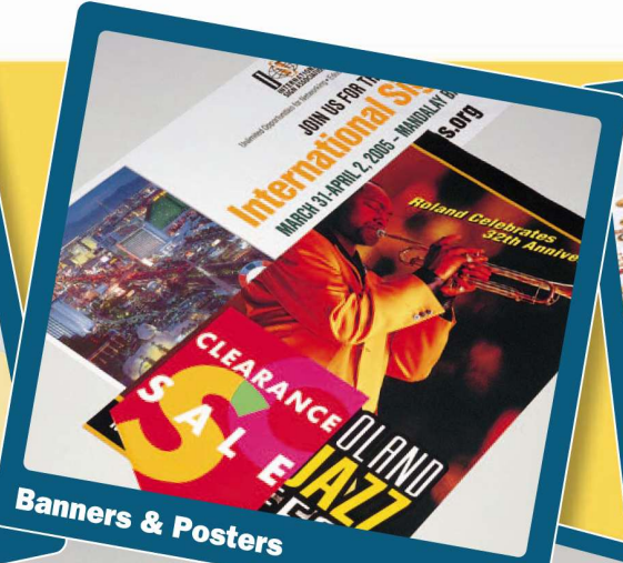
Banners & Posters