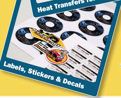
Labels, Stickers & Decals