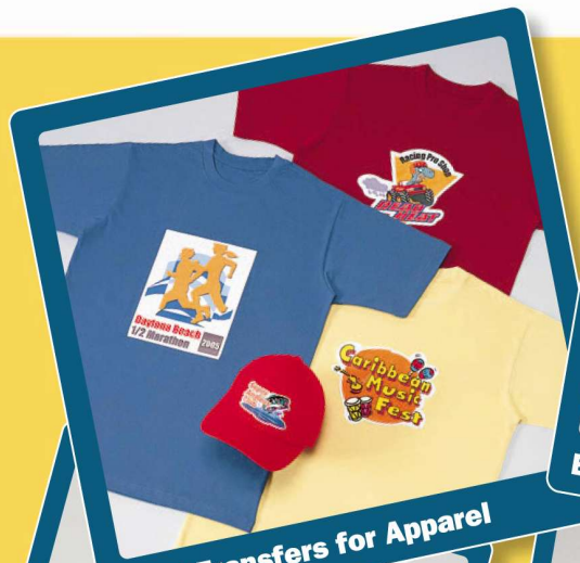
Heat Transfers for Apparel

*Three years outdoor durability is based on accelerated weather tests conducted by Roland DG. Results may vary depending upon location and application. Severe applications, such as floor and vehicle graphics, require lamination.