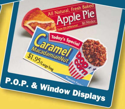
P.O.P. & Window Displays