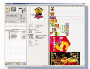
•VersaWorks's main menu