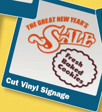
Cut Vinyl Signage