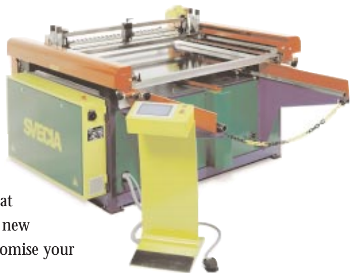
The Sveciamatic sizes 1050x1450 and 1200x1600 have rear delivery as standard. The size 1400x1800 has left hand side delivery as standard.

The latest model has a very high specification with all kinds of innovative features as standard. The unique touch screen operating panel, integrated PLC-controls and new software ensures that the Sveciamatic will easily meet the challenges of the new Millenium. The options available enable you to customise your machine to meet your production needs exactly.